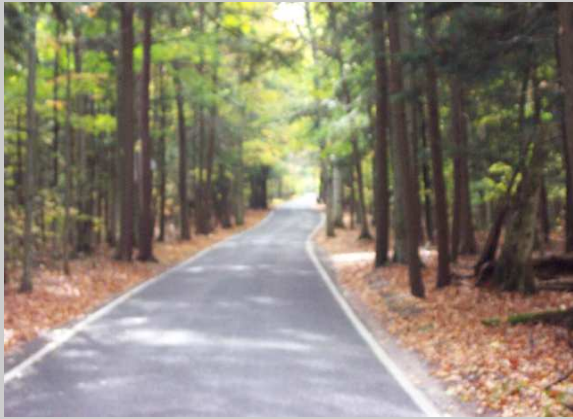
M-119's scenic "Tunnel of Trees" attracts motorists and non-motorized visitors.

M-119's scenic "Tunnel of Trees" is enjoyed by many people—full time and seasonal residents, visitors, and vacationers, and those who travel the corridor in automobiles, motorcycles, or bicycles to revel in its natural beauty.